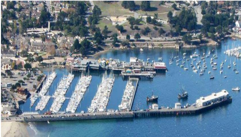
Monterey Harbor and Marina